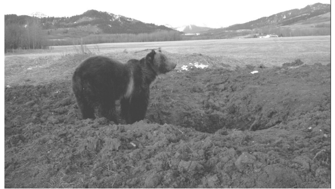
BEARS HAVE AN EXCELLENT SENSE OF SMELL. HERE, A GRIZZLY BEAR UNEARTHS CONTENTS OF A DEADSTOCK PIT.

Biosphere Reserve's Carnivores and Communities Program has brought together landowners and funders to provide free deadstock removal services within high conflict areas of southwestern Alberta. Landowners that live within the project area (see "orange zone" on map) are eligible for free onsite pickup and use of deadstock bins.