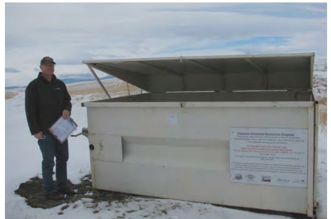
WITH CFIA SPECIFIED RISK MATERIAL (SRM) PERMITS, DEADSTOCK BINS CAN BE USED ANYTIME.