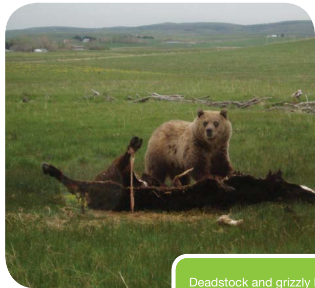
Deadstock and grizzly bear

Attempts are often made to bury dead livestock to prevent access by bears and other scavengers. The reality is that bears are opportunistic feeders guided by a good nose and will likely discover deadstock piles at some point in time as livestock carcasses are a desirable food source for bears. If the location of the deadstock is close to outbuildings, ranch houses, or calving pens, issues of public safety, possible property damage, or future predation of livestock can be a concern.